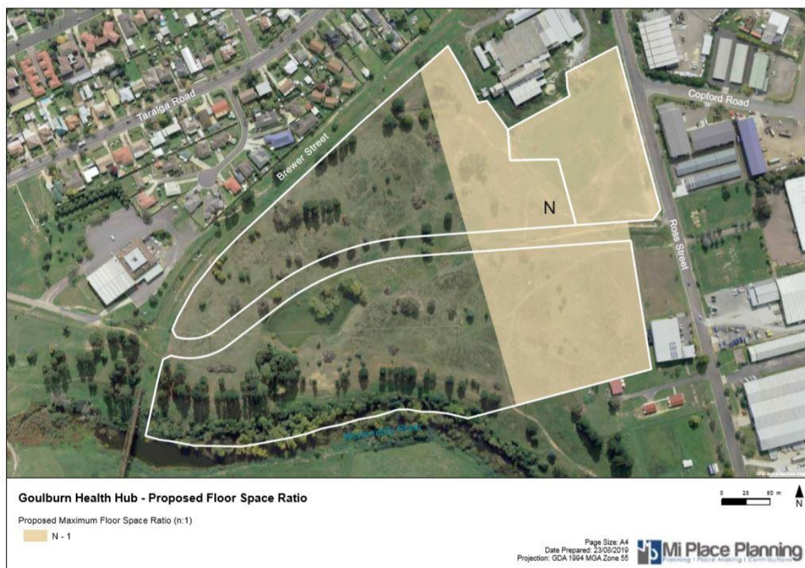
Figure 10 - Proposed FSR Map