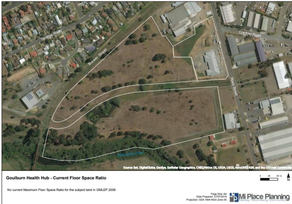
Figure 5 - Current Floor Space Ratio (GMLEP 2009)