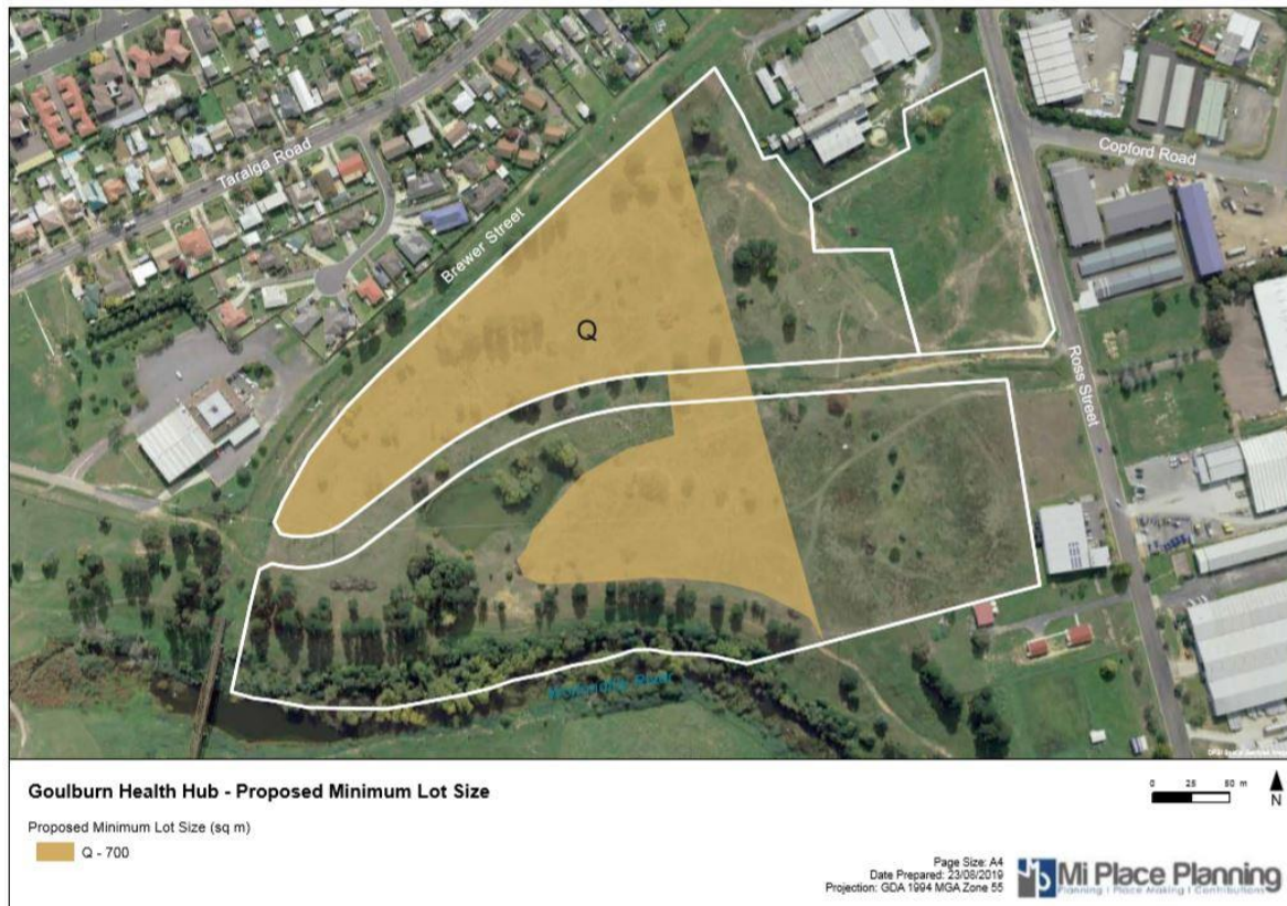
Figure 11 - Proposed Lot Size Map