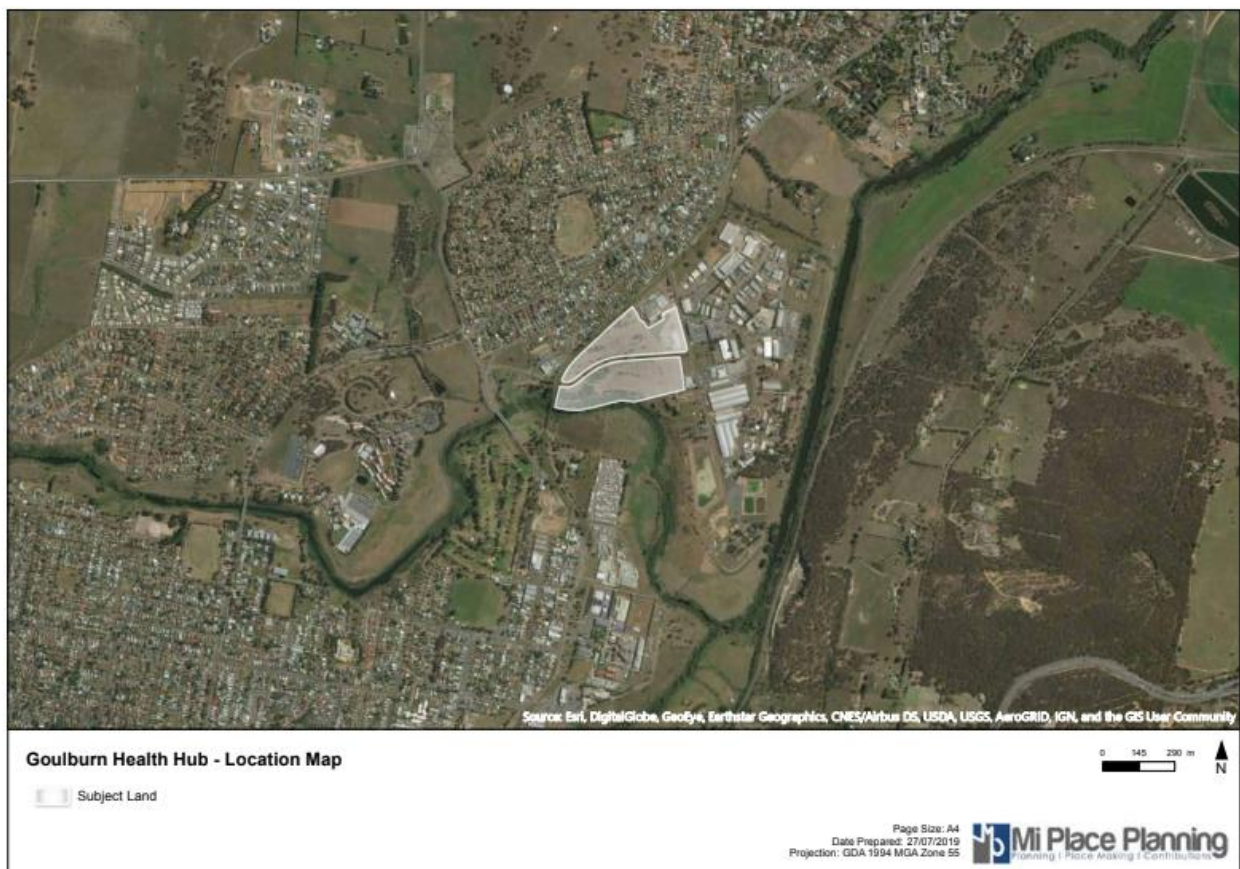
Figure 1 - Location Plan

This PP applies to land within the Goulburn Mulwaree Local Government Area (LGA), as shown in Figure 1 below. The subject land is located at 37 Ross Street and 23 Brewer Street, Bradfordville and is legally described as Lots 100 and 101 DP 1214244.