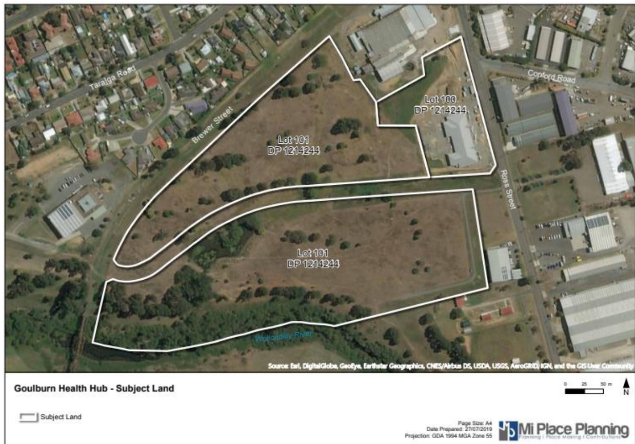
Figure 2 - Subject Land

Lot 100 contains an existing multi-disciplinary medical centre with allied health facility and a valid development approval for a day surgery. The remainder of the site is vacant and generally flat land with scattered vegetation; and the Wollondilly River runs along the southern boundary of the site as shown in Figure 2 below.