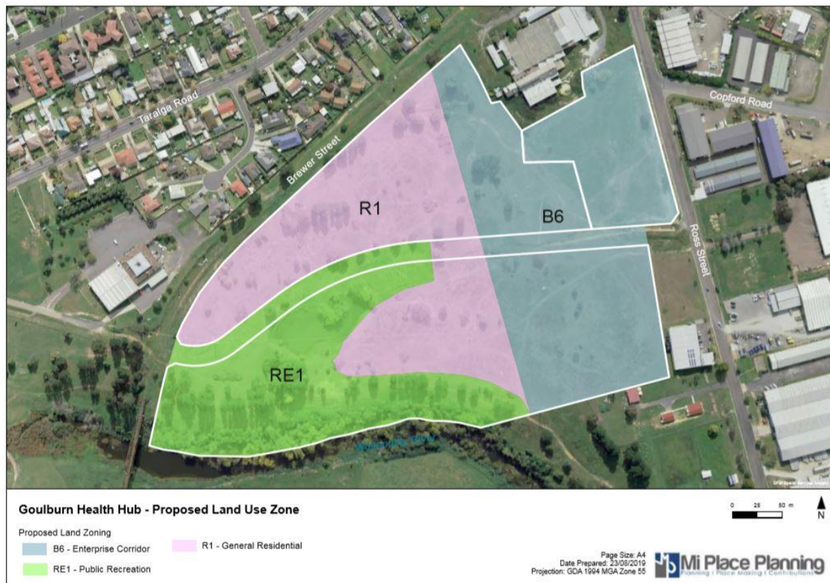
Figure 8 - Proposed Zoning Map

The proposed land use zone, height of buildings, FSR and minimum lot size amendments are illustrated in Figures 7 to 10 below.