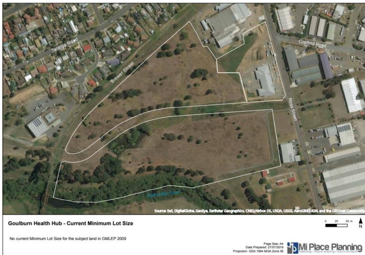
Figure 6 - Current Minimum Lot Size (GMLEP 2009)