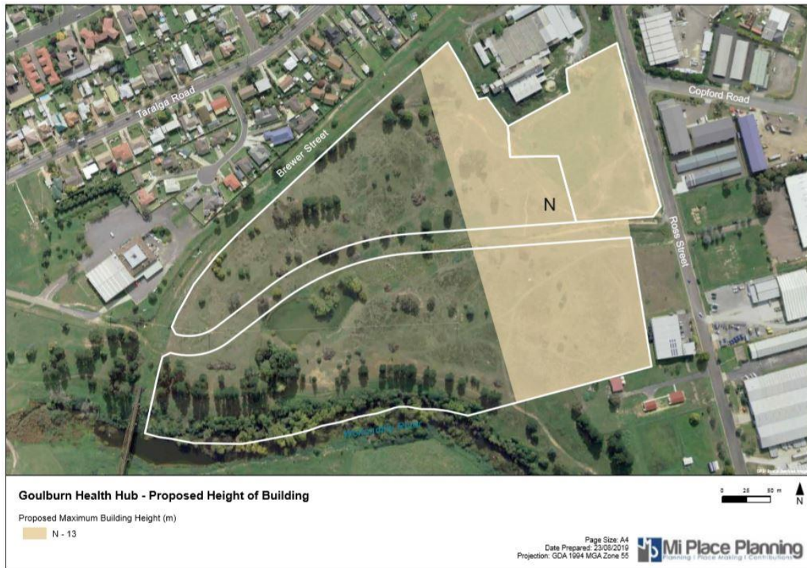
Figure 9 - Proposed Height of Building Map