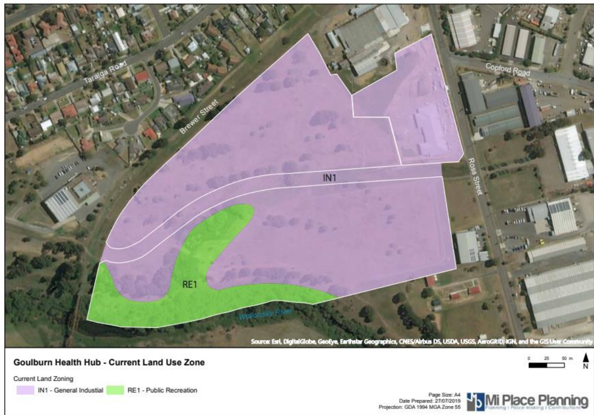
Figure 3 - Current Land Use Zone (GMLEP2009)