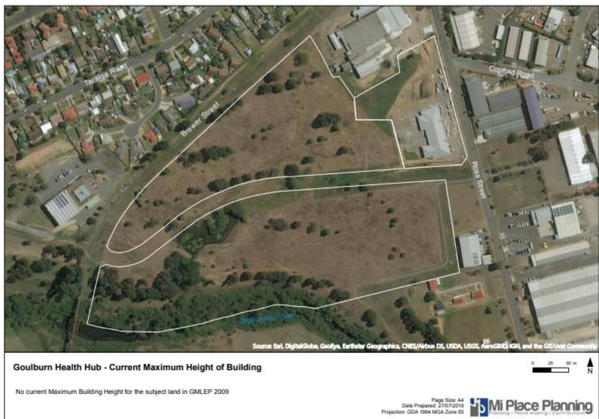
Figure 4 - Current Height of Building (GMLEP2009)